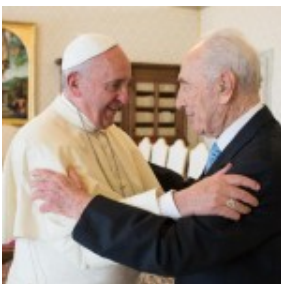
Francis & Peres

This he said in reaction to the religious conflict that is raging in the middle east. At the same time, the meeting with Peres and the Papacy took place. What was said at that time will show itself to be, at least, the spirit of the time, and at most, a great advance towards the papacy’s revival of persecution.