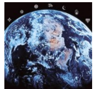
The Union of the Children

“And after these things I saw another angel come down from heaven, having great power; and the earth was lightened with his glory. And he cried mightily with a strong voice, saying, Babylon the great is fallen, is fallen, and is become the habitation of devils, and the hold of every foul spirit, and a cage of every unclean and hateful bird. For all nations have drunk of the wine of the wrath of her fornication, and the kings of the earth have committed fornication with her, and the merchants of the earth are waxed rich through the abundance of her delicacies. And I heard another voice from heaven, saying, Come out of her, my people, that ye be not partakers (Grk: participate/fellowship) of her sins, and that ye receive not of her plagues. For her sins have reached unto heaven, and God hath remembered her iniquities.”