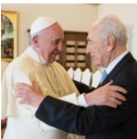
Francis & Peres

This he said in reaction to the religious conflict that is raging in the middle east. At the same time, the meeting with Peres and the Papacy took place. What was said at that time will show itself to be, at least, the spirit of the time, and at most, a great advance towards the papacy’s revival of persecution.