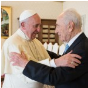
Francis & Peres

This he said in reaction to the religious conflict that is raging in the middle east. At the same time, the meeting with Peres and the Papacy took place. What was said at that time will show itself to be, at least, the spirit of the time, and at most, a great advance towards the papacy’s revival of persecution.