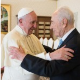
Francis & Peres

In the meeting, Shimon Peres, having newly retired from the presidency of Israel, is pursuing a new project. Peres, who has said that he believes that this new pope represents “a continent which is now awakening” said the following to the Pope: