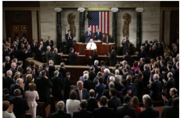
Standing where he ought not...

Charismatic communities who are grabbing earnestly to wield political influence and power. Lastly, in the meeting, he called “the separation of church and state” “a bunch of garbage”; all this proclaimed by leading Charismatics in the very heart, where the memorial of the Constitutional Republic was erected.