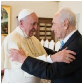
Francis & Peres

This he said in reaction to the religious conflict that is raging in the middle east. At the same time, the meeting with Peres and the Papacy took place. What was said at that time will show itself to be, at least, the spirit of the time, and at most, a great advance towards the papacy's revival of persecution.