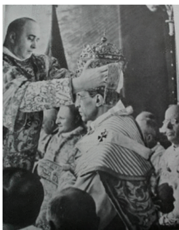
The Papal tiara

However, the doctrine that Christ has come and established His throne over this world presently is a doctrine that has gained widespread attention in the professed Christian world; in adhering to such a doctrine, they have practically crucified the confession of Christ before the cross that this present world was not His kingdom. The child doctrine of such a teaching has naturally followed such a belief, that the church should have authority over the kings of this earth. Such a deception has been successful, and Satan is well-pleased to furnish the deception, and transforms himself into an angel of light, even making himself to appear as Christ Himself, that he might receive the worship and honor that belongs to Him.