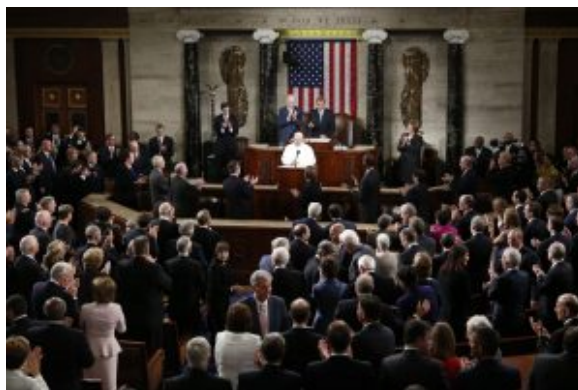
Standing where he ought not...

called “the separation of church and state” “a bunch of garbage”; all this proclaimed by leading Charismatics in the very heart, where the memorial of the Constitutional Republic was erected.