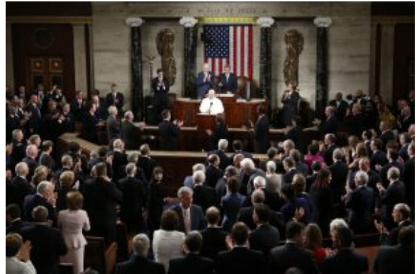
Standing where he ought not...

called “the separation of church and state” “a bunch of garbage”; all this proclaimed by leading Charismatics in the very heart, where the memorial of the Constitutional Republic was erected.