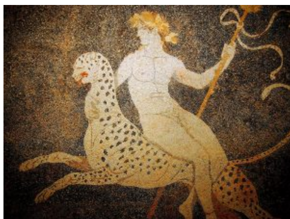
The Grecian god Dionysius sat enthroned on a leopard.

THE THIRD BEAST: “After this I beheld, and lo another, like a leopard, which had upon the back of it four wings of a fowl;”