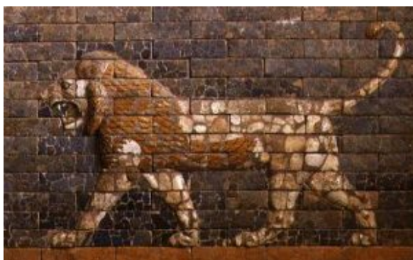
Ishtar's lion on the walls surrounding Babylon

FIRST BEAST: "The first was like a lion, and had eagle's wings..."