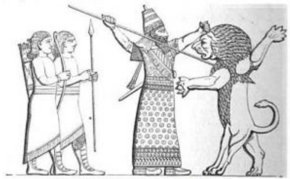
King, with attendants, spearing a lion (Koyunjik).

Tiglath-Pileser I depiction; a symbol of coming judgment